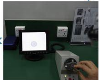
Cleaning end face