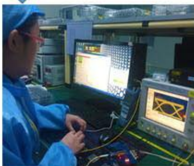
Product Initial Test