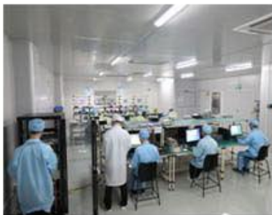
Standardized Production Line

Continuous introduction of new equipment, produced by strict standards, strict quality inspection, to guarantee the high quality standard of each product.