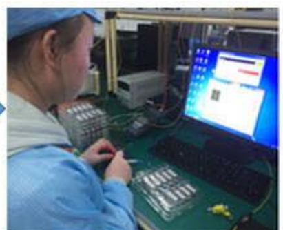
Product Final Test