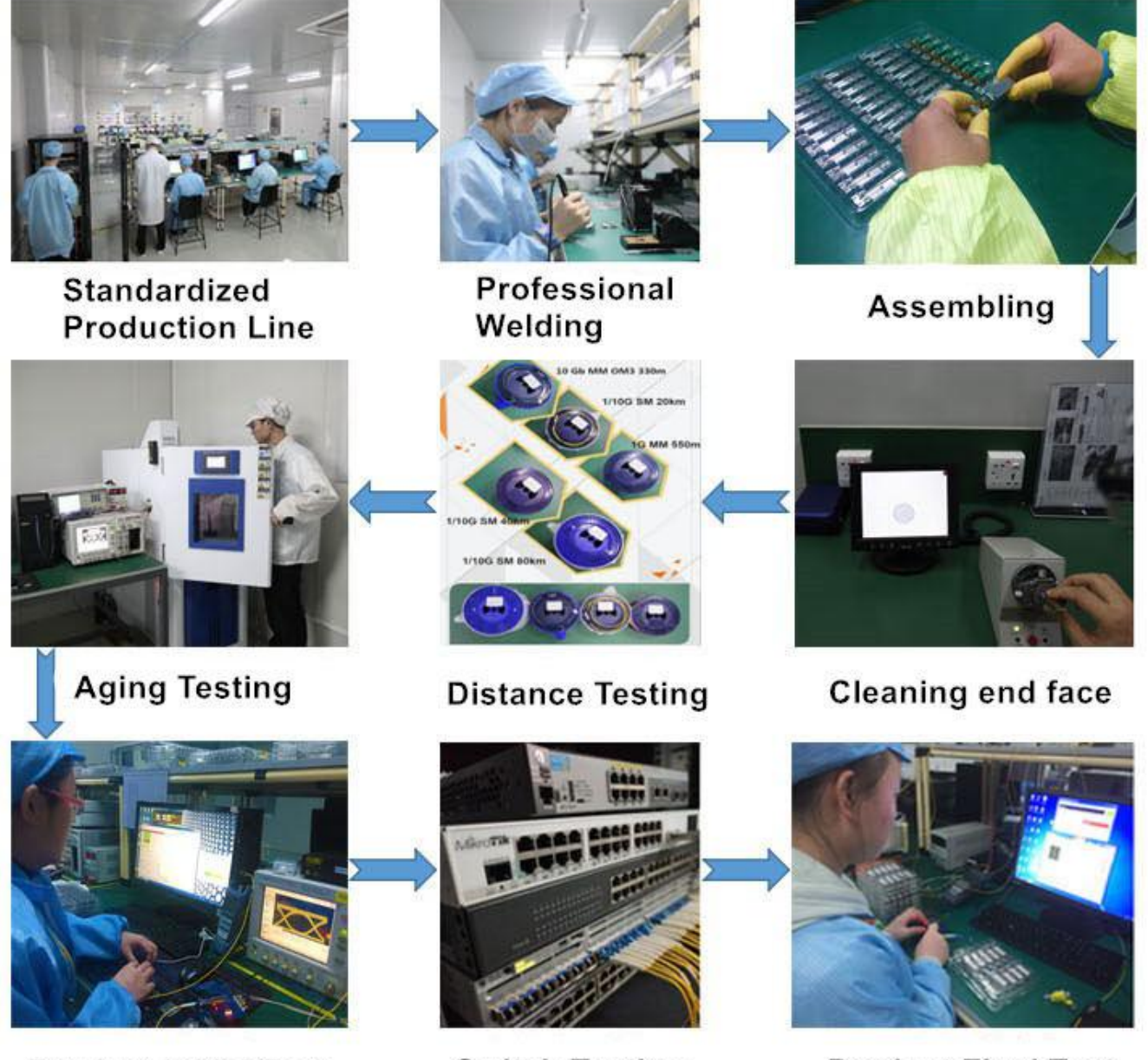
Product Initial Test

Continuous introduction of new equipment, produced by strict standards, strict quality inspection, to guarantee the high quality standard of each product.