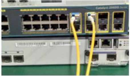
Cisco Catalyst 2960G