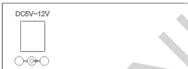
Fig.3 Rear panel