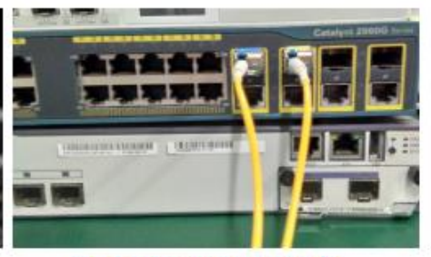
Cisco Catalyst 2960G