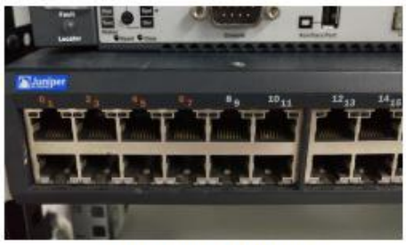
Juniper EX 4200