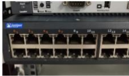
Juniper EX 4200