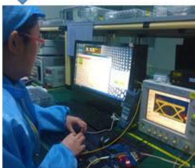
Product Initial Test