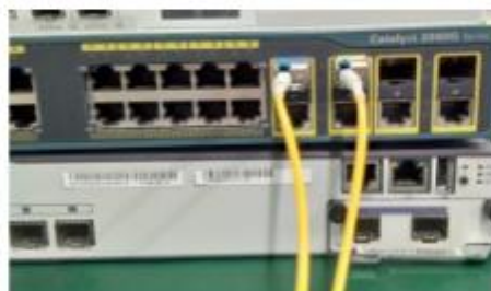
Cisco Catalyst 2960G