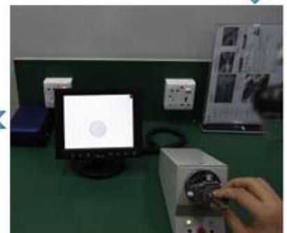
Cleaning end face