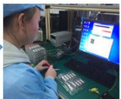
Product Final Test