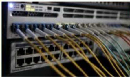
Cisco Catalyst 3850

Our test equipment: VOLKTEK MEN-4110, HP 2530-8G, CRS226-24G-25+RM, Catalyst 2960G Series, Catalyst 3850 XS 10G SFP+, Catalyst 3750-E Series, HUAWEI S5700Series, H3C S3100V2 Series, Juniper-EX4200, etc.